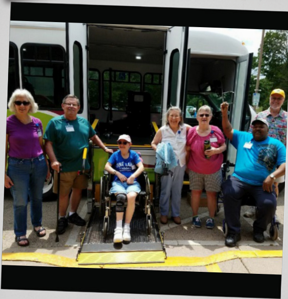
On a sunshine-filled day in June, folks from the Adult Day Center took a trip to Olbrich Gardens.