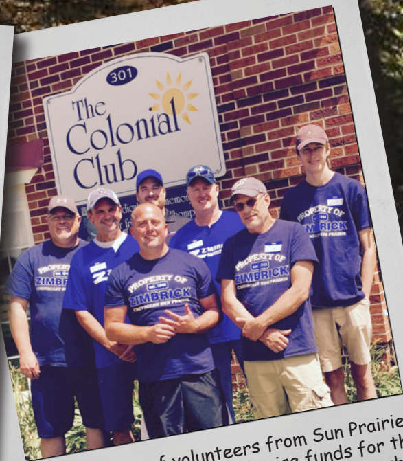
A great group of volunteers from Sun Prairie's Zimbrick Chevrolet helped raise funds for the Colonial Club at the annual August Brat Bash.