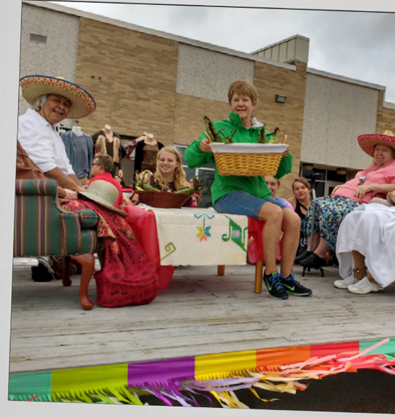
Colonial Club celebrated diversity with the 2017 Cornfest parade entry.