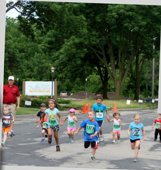
Future Colonial Club participants took part in the kids 50 yard dash at StrawberryFest.